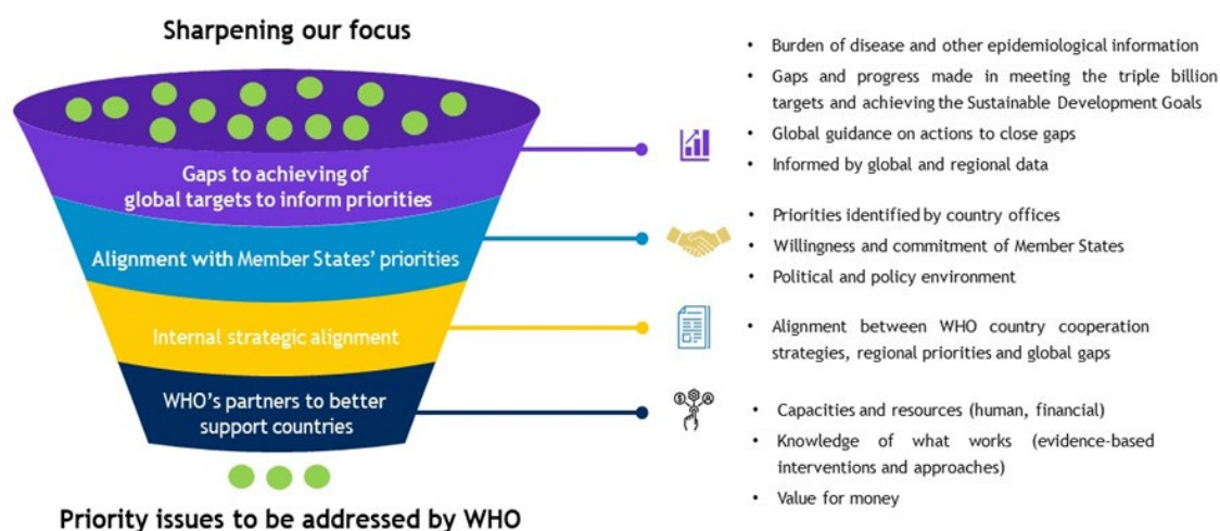
Figure 1. An enhanced approach to priority-setting for the WHO PB24-25

10. Leadership in WHO country offices will be responsible for convening prioritization consultations at country level (second level of Figure 1), engaging key government counterparts and relevant partners. Each region will apply an approach appropriate to their region, but will use a common set of minimum criteria, as set out below.