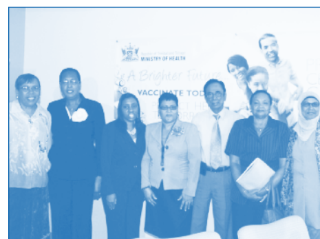
REPRESENTATIVES FROM THE NATIONAL PARENT TEACHER ASSOCIATION, FAMILY PLANNING ASSOCIATION, AND STAFF FROM THE MINISTRY OF HEALTH OF TRINIDAD AND TOBAGO

Numerous training and sensitization sessions were also conducted for nurses, physicians, principals, parent-teacher associations, and religious groups. Media communication efforts included newspaper advertisements and a list of frequently asked questions on the Ministry of Health's website. ■