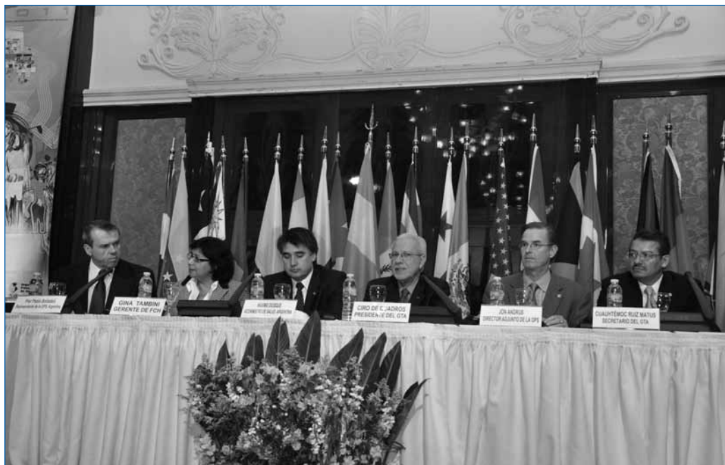
XIX TAG Meeting - Buenos Aires, Argentina.

This meeting highlighted the achievements of the countries in the Region, as well as new challenges for continued protection of their populations. The motto for the meeting, "Vaccinate your family, protect your community", reflects the importance that the TAG and the Immunization Program attribute to expanding the benefits of immunization to the community as a whole. The meeting aimed at eliciting TAG recommendations to address current and future challenges for immunization programs in the Americas. Many of which are highlighted in this article.