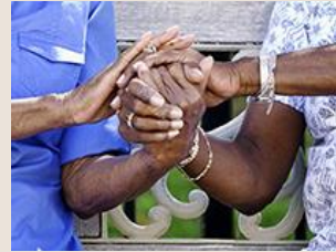
Mission Partnerships & Programs