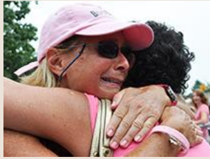
Affiliate & National Community Health Programs