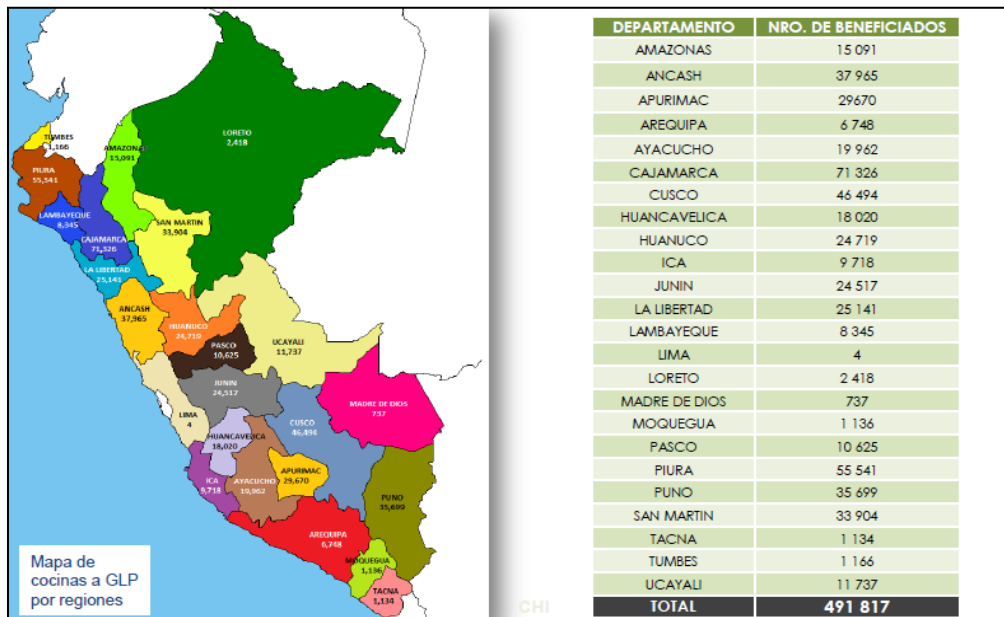
LPG stoves distributed by region

In 2014, the new government set the goal to distribute one million LPG cookstoves in 5 years. The Plan for Universal Access to Energy 2012-2022 considers the implementation of improved cookstoves in areas where there is no market for LPG or natural gas 2 . Until now, the new government has distributed 60,000 additional biomass stoves with chimney and 491.817 LPG stoves and vouchers of 32 soles for purchase of LPG (9.15 dollars at February 15, 2016). MINEM transferred to MIDIS funds for the distribution of 60,000 biomass stoves by 2015.