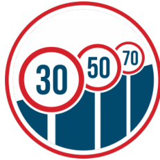
LOWER SPEED LIMITS