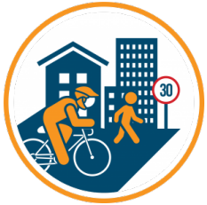
30 KM/H ZONES

Priority Interventions. Set of interventions that have been proven to be among the most effective in reducing road deaths and injuries.