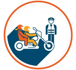
MOTORCYCLE HELMET LAW + ENFORCEMENT + PROMOTION