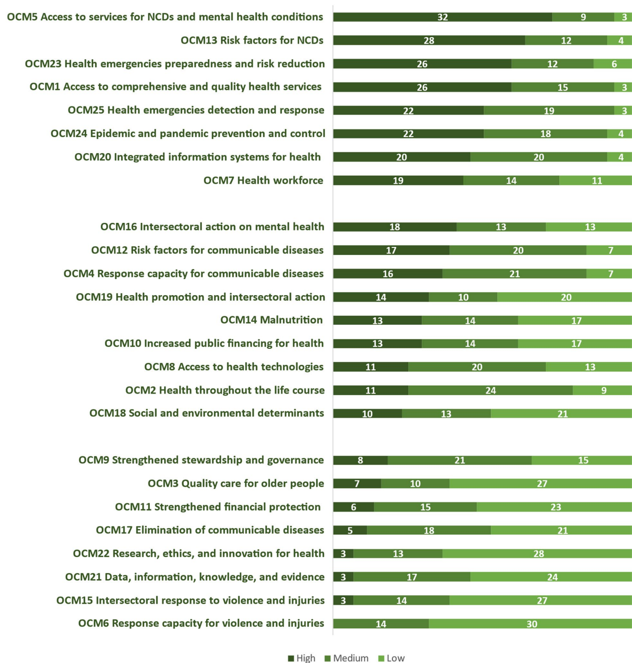
Figure 1. Aggregated Prioritization Results for the Program Budget 2024–2025 (Number of countries and territories by priority rating for each outcome)

Note: Outcomes 26, 27, and 28 were excluded due to the corporate nature of their scope.