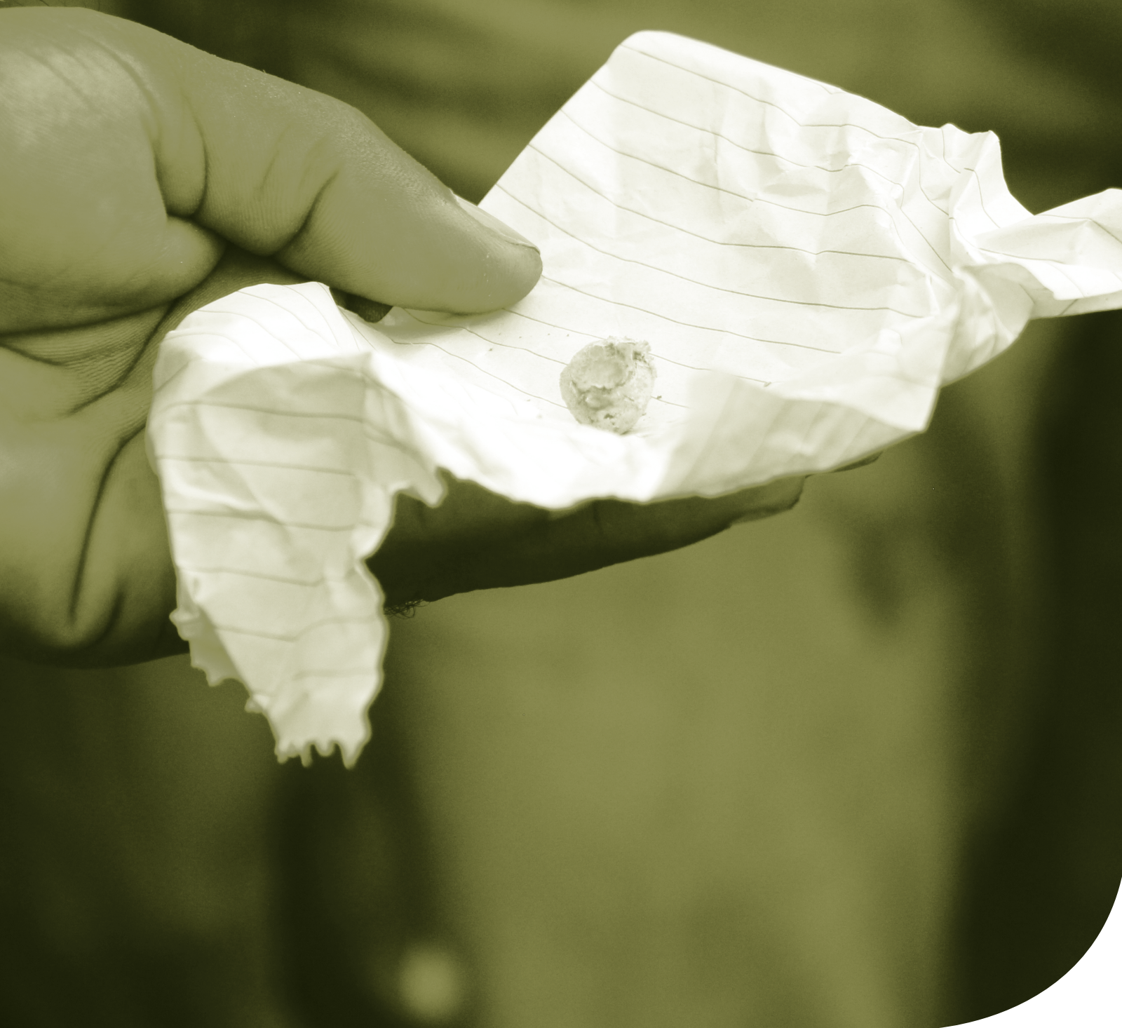
Sponge gold: the output of the burning step in ASGM when amalgam is heated to separate mercury from the gold.