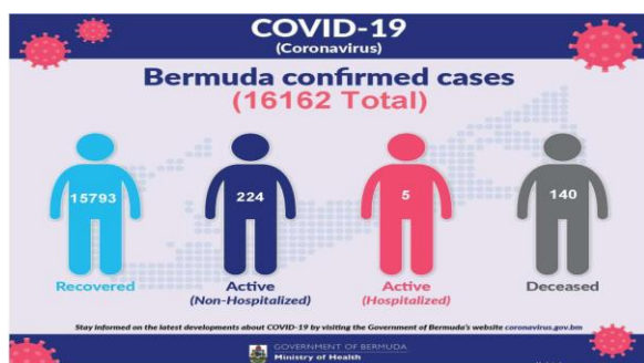
Table 2. Summary as at end of Epidemiological Week 25 (19 – 25 June 2022).

As of 27 June 2022 (reported on 29 June 2022), Bermuda confirmed a total of 16,162 cases of Coronavirus Disease 2019, with 25 new cases within the last 24-hour period. There were 229 active cases (1.4% of total cases), 5 hospitalized cases (2.2% of active cases), with no ICU admissions. New cases have increased by 0.9% during EW 23 , with the total number of deaths increasing by 2 to 140 .