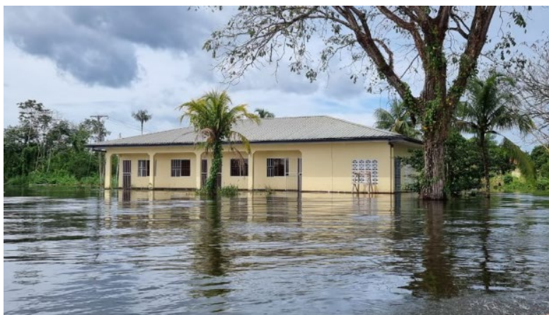
Flooding in New Lombe, 01 June 2022.