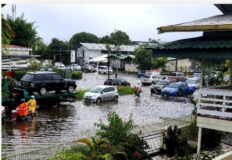
Flooding in Paramaribo, 30 May 2022.