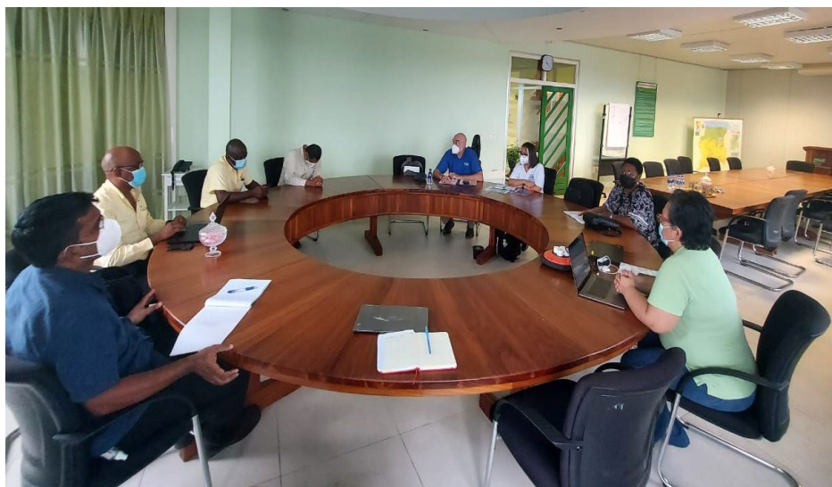
Meeting with MOH and MZ, 30 May 2022.