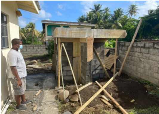
Installation of water base at Colonaire Health Centre