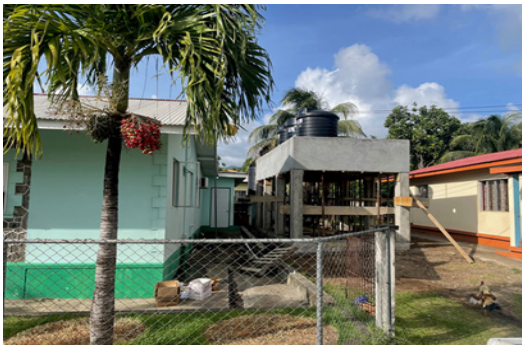
Ongoing works at Calliaqua Health Centre. Under the water tanks the MoH funded a dental area.