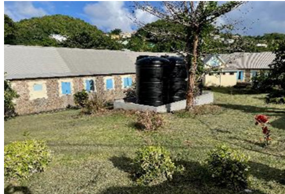
Installation of water tanks at the Mental Health Rehabilitation Centre