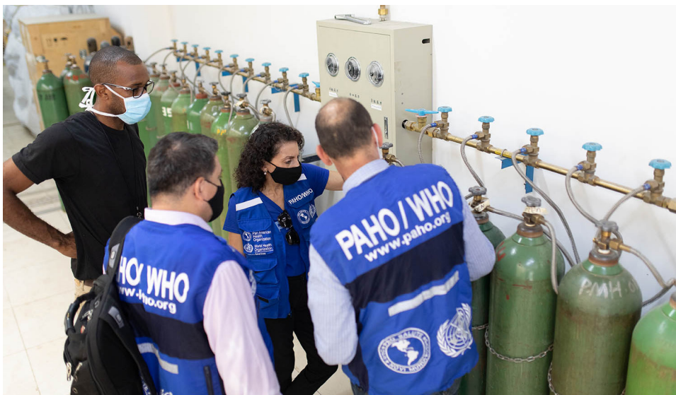
A team of PAHO experts visited Dominica September 21-25, 2021 to support the Ministry of Health in the assessment of their PSA Oxygen Plant China Friendship Hospital in Roseau. The team also carried out a health system's needs assessment including healthcare services capacity, human resources for health measures, and current needs of medical oxygen to improve the country's response to COVID-19.