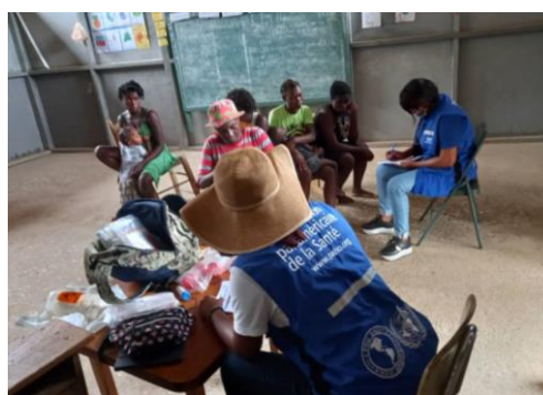
PAHO/WHO and mobile health clinic carrying out COVID-19 testing in Grand'Anse Department