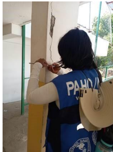
PAHO/WHO and Ministry of Health structural engineers carrying out Saint Antoine Hospital assessment.