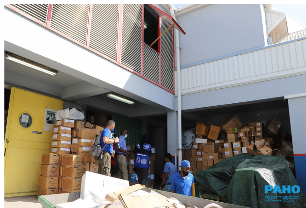
Storage of supplies on the compound of the central medical stores