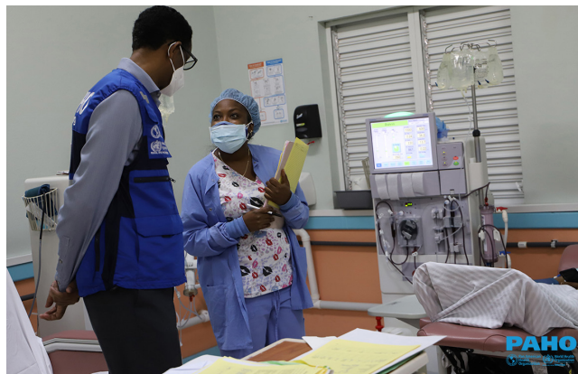
PWR-ECC visits Evesham Health Centre where hemodialysis services are provided.