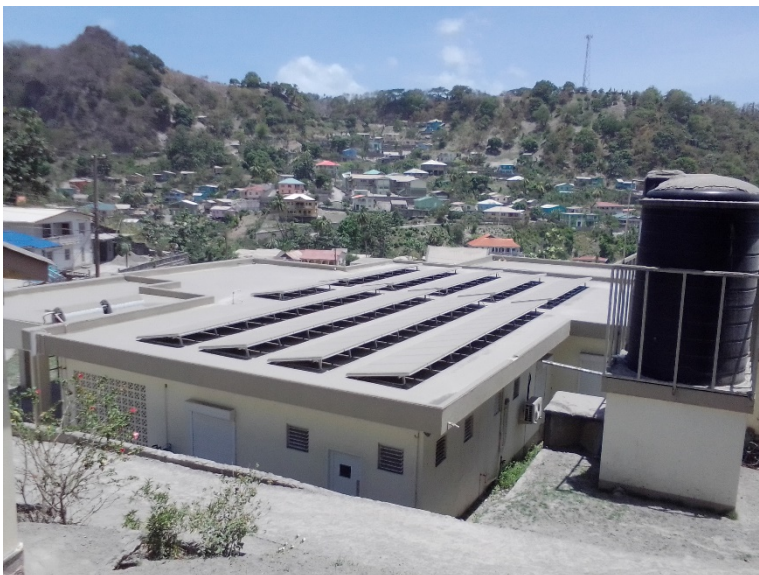
Chateaubelair Clinic rooftop covered in ash.