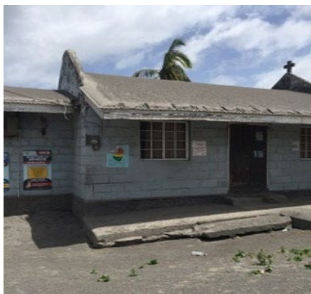
Overland Health Centre