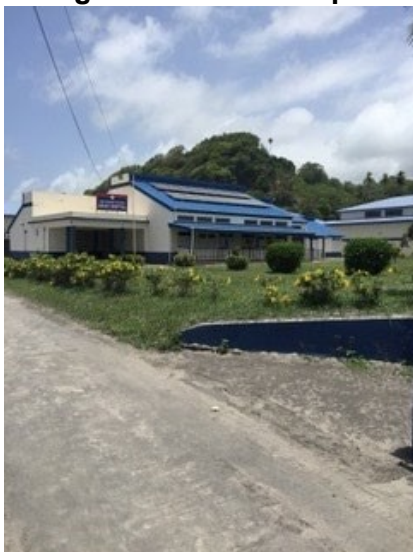
Georgetown Smart Hospital