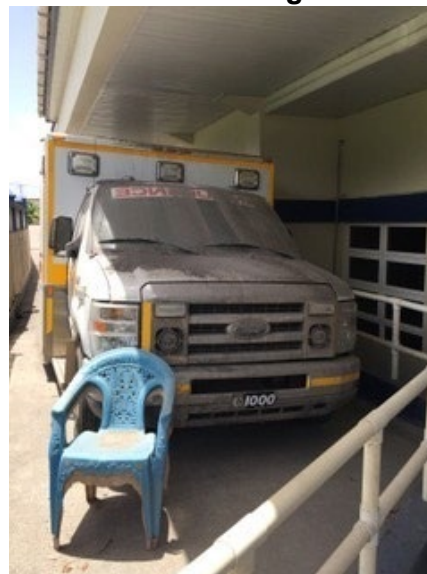
Modern Medical Diagnostic Centre