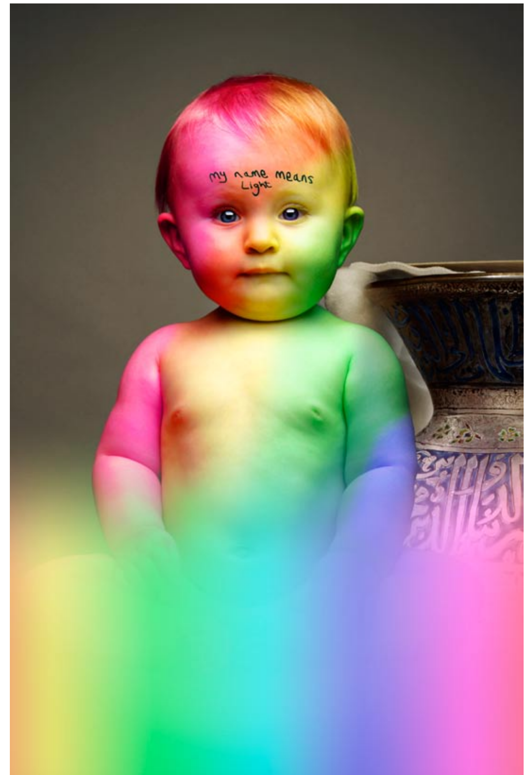
Ailena Koudoua with the Mosque Lamp, c. 1300s - My name means light

Ailena's name comes from the Greek word light. She sits next to a mosque lamp, which is inscribed on the side with the name Muhammad ibn Qala'un, the Mamluk Sultan of Egypt. Rows of similar lamps would have been used to decorate mosques and tombs of the sultans and their senior officials. The techniques of enameling and gilding on glass developed in Syria in the 12th century, reaching Egypt in the 13th and 14th centuries. Thus, the traditional form of a hanging lamp was transformed from a plain transparent vessel into an object of great splendor and beauty.