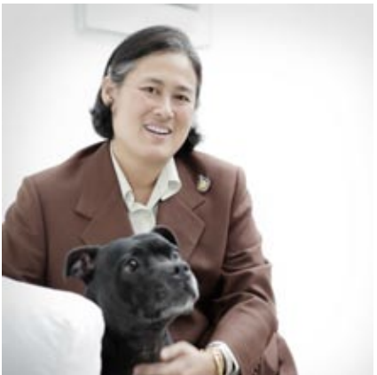
HRH Princess Maha Chakri Sirindhorn of Thailand