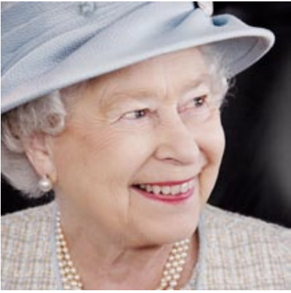
HM Elizabeth II