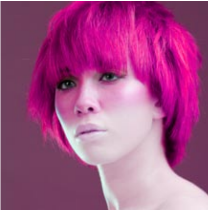
Collection for Toni & Guy