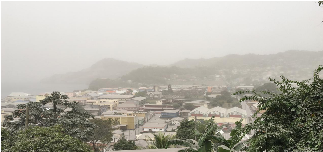
View of Kingstown