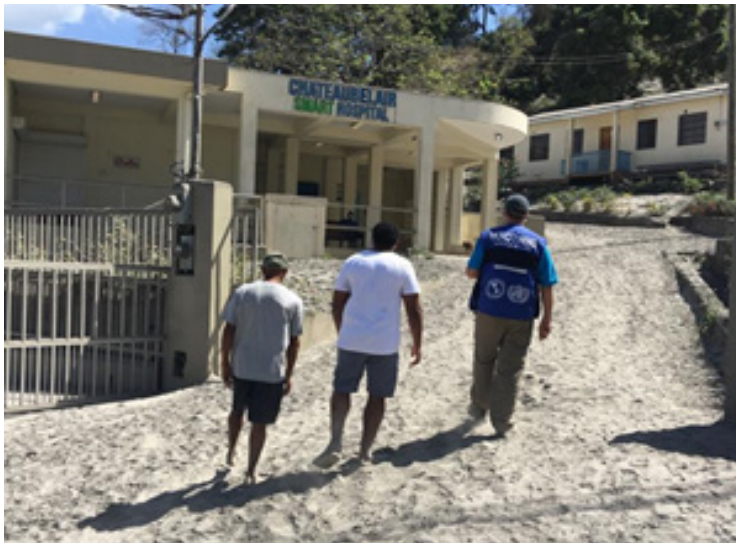
Assessment of Chateaubelair Smart Hospital