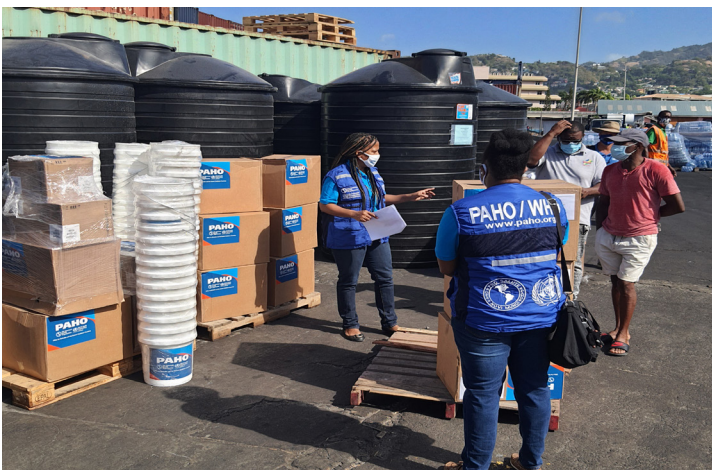
PAHO and MoH Personnel reviewing delivered medical supplies and materials, supplied by PAHO according to the MoH needs list (see annex).