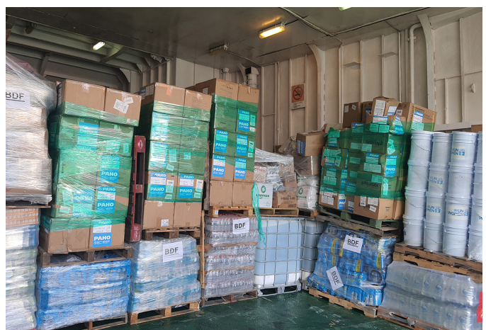
Medical supplies and materials, supplied by PAHO according to the MoH needs list (see annex), arrived in VCT 24 April 2021.