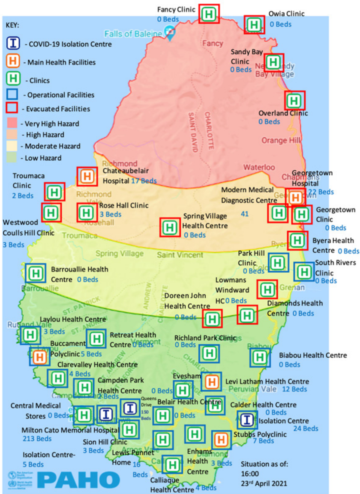
Figure 1. Map showing location of Health Care Facilities