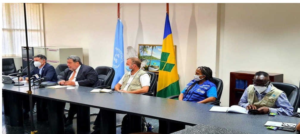
UN Global Flash Appeal