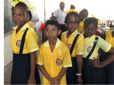
Students at Westfield Primary School, in Georgetown, Guyana, waiting for their turn to be tested for LF and other diseases

The elimination of LF is of paramount priority to Guyana's Ministry of Public Health. The training will empower Guyana's LF program to undertake the survey successfully and obtain data that will allow the Ministry to make decisions regarding MDA. The integration of MBA to measure immunity profiles strengthens the national capacity of laboratory teams to collect information on other diseases and will be useful in the formulation of training manuals for other countries wishing to engage in similar surveys.