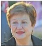
STANDS READY: Managing Director of the International Monetary Fund Kristalina Georgieva.

There is no known cure for the virus that was first detected in China and blamed for nearly 3,000 deaths globally. Last weekend, three Caribbean countries, including the Dominican Republic, recorded cases of the virus and at a special meeting in Barbados, regional leaders and other health care stakeholders noted that "the capacity to manage an outbreak