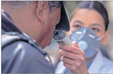
TEMPERATURE CHECK: A nurse checks a man's temperature at the entrance of Tijuana's General Hospital, in Tijuana, Mexico, yesterday. Mexico confirmed its fifth case of the new coronavirus yesterday.