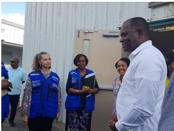
Prime Minister Hon Roosevelt Skerritt address the PAHO team during the visit to Portsmouth isolation facility

PAHO deployed teams to assist with Infection Prevention Control (IPC), Health Systems Organization, Risk Communication and Community Engagement