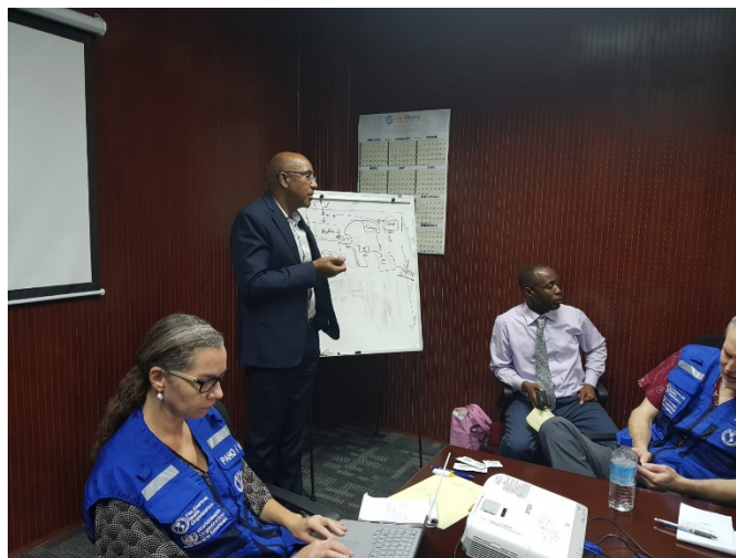
Minister for Health, Wellness and New Health Investment, Dr Irvine McIntyre, discussing COVID-19 public health measures with the PAHO team