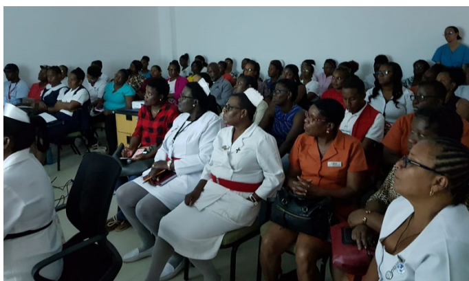
Nurse attending one of the Personal Protective Equipment (PPE) workshops