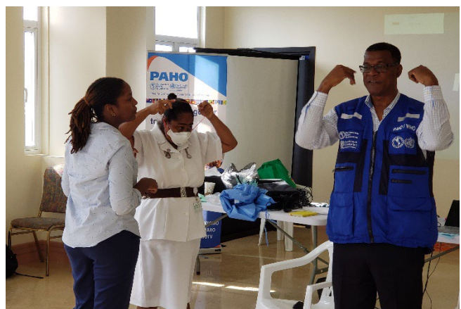
In Grenada, demonstration of donning and doffing of PPE.

For more information on COVID-19 visit: www.paho.org/coronavirus Visit our website: www.paho.org/ecc