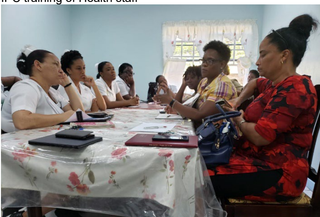
In Bequia, nurses working on organization of health services simulation exercise