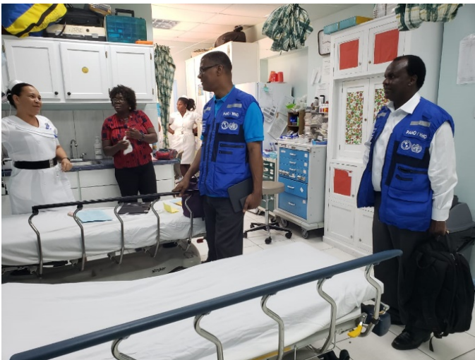
Tour of the Emergency Room of the Bequia Hospital in St. Vincent and the Grenadines

During country missions when PAHO deployed teams to assist with Infection Prevention Control (IPC), Health Systems Organization, Risk Communication and Community Engagement, nurses were always at the forefront. Today, World Health Day, as we celebrate nurses and midwives, we are pleased to share a few of the moments.