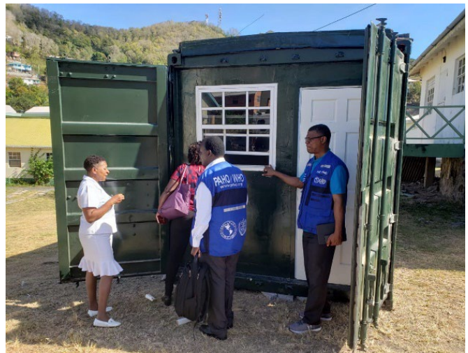
Inspecting an COVID-19 triaging station at the Bequia Hospital