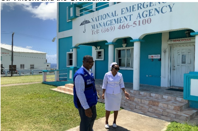
In St Kitts, an Infection Prevention and Control Nurse outside the National Emergency Management Agency after completing IPC training of Health staff