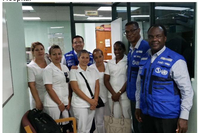
The team with Cuban nurses in Grenada