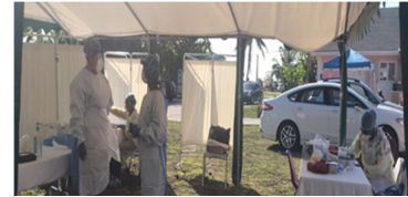
Figure 1: HCWs at field sample collection site on Bimini Island