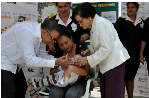
The president of El Salvador, Carlos Mauricio Funes and the Minister of Health, Maria Isabel Rodriguez vaccinate a child during the VWA launch.