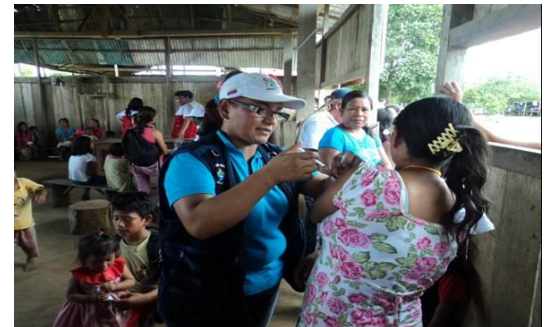
Vaccination of a woman of childbearing age in Peru, 2012.