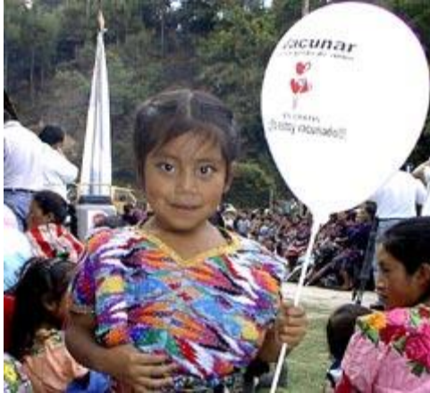
Quiché girls hold Vaccination Week balloons during Guatemala's official launching of the campaign in the municipality of Chichicastenango.

of the village of Agua Escondida in Guatemala.