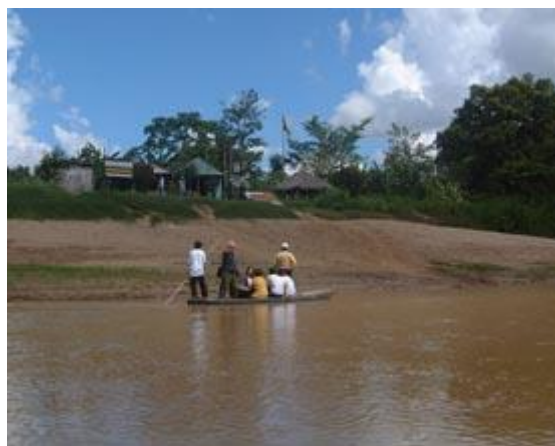
Health workers travel by boat to vaccinate children in remote towns and villages in the border area of Bolivia, Peru and Brazil.

In the towns of Bolpebra, Iñaparí and Asís, on the borders of Bolivia, Peru and Brazil, health officials and residents braved 115-degree weather to launch the campaign, seeing campaign workers off as they departed on canoes for towns accessible only by boat. Among the participating dignitaries were Minister of Health of Bolivia Javier Torres Gotilla, Vice-Minister of Health of Peru Carlos Rodríguez and representatives of Brazil's Ministry of Health.