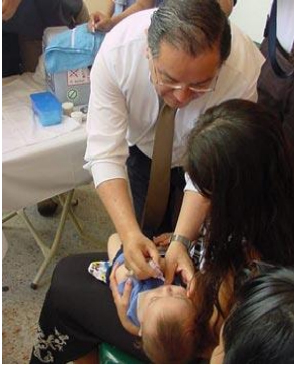
Minister of Health of El Salvador José López Beltrán administers an oral polio vaccine to an infant in San Martín, El Salvador.