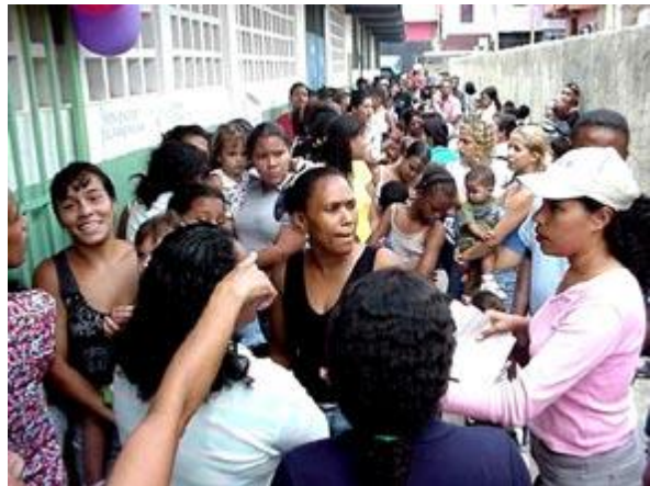
Mothers line up with their children in the Petare district of Caracas, Venezuela , on the first day of Vaccination Week in the Americas. Minister of Health María Urbaneja was on hand for the campaign's launching in the Catia neighborhood of the country's capital.

Uruguay made a special effort to reach children in marginal areas of the departments of Montevideo, San José and Canelones. The goal was to achieve 95 percent vaccination coverage in those regions.