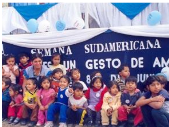
Children on the Peru side of the Peruvian-Ecuadorian border wear special stickers after getting their shots.

Nineteen countries from South and Central America and the Caribbean participated in the campaign, which focused especially on children who had never been vaccinated or who needed to complete their vaccine series. A major objective was to consolidate the interruption of measles (which has not circulated in the region for more than six months) as well as to maintain polio eradication and protect children from other vaccine-preventable diseases.