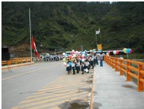
Schoolchildren parade to celebrate Vaccination Week in the Americas at the border crossing between Ecuador and Peru.

Women, children, young people and adults all welcomed visitors from distant places, sharing smiles and embraces and showing a profound desire to improve their living conditions and their families' health. Parents with babies in their arms lined up alongside young women of childbearing age to get vaccinations that will protect themselves from disease.