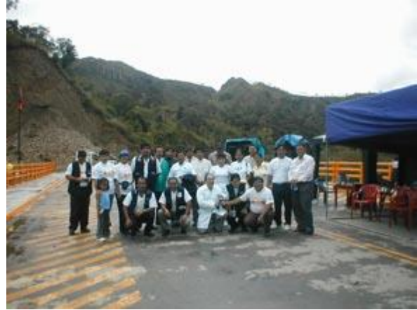
Health workers gather at the border crossing at Jaen, Peru, on the Peru-Ecuador border.

The launching of Vaccination Week in the Americas demonstrated the importance of health actions as a bridge between peoples to build understanding, cooperation and hopes for a better future.