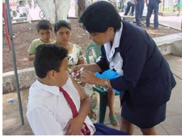
A health worker vaccinates a school-age child. The regional campaign made special efforts to reach children who had never been vaccinated and those whose vaccine series were incomplete.