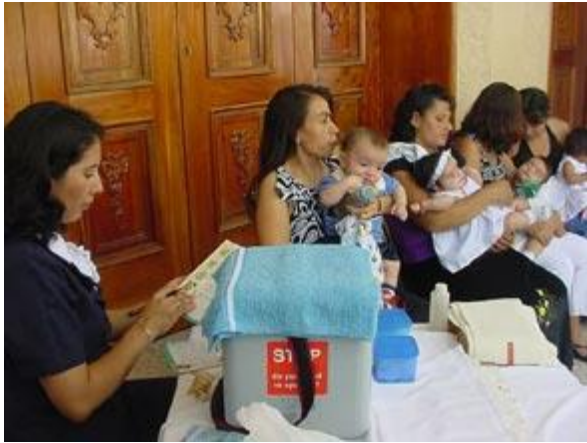
Mothers wait to get their babies vaccinated in San Martín, San Salvador.