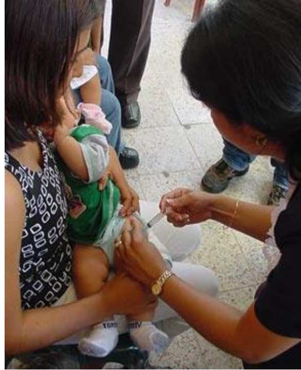
An infant is vaccinated during the launching of Vaccination Week in the Americas in El Salvador.