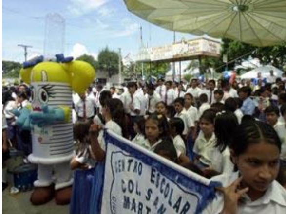
Children gather in San Martín, in El Salvador's department of San Salvador, for the launching of Vaccination Week in the Americas.