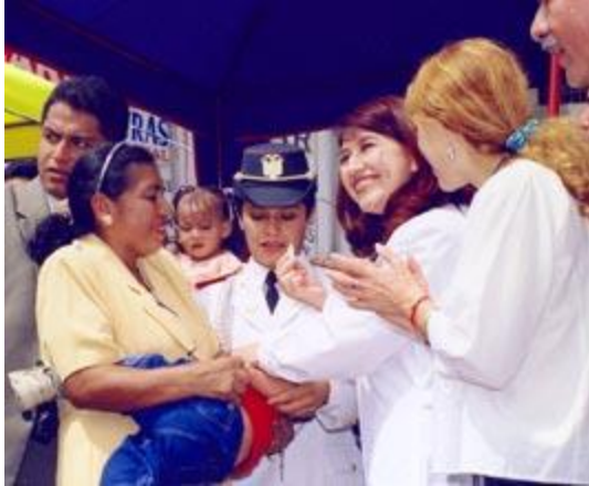
First lady Eliane Karp de Toledo of Peru (right) watches as first lady of Ecuador Ximena Bohórquez (second from right) administers oral polio vaccine to a child in Huaquillas, Ecuador, near the Peruvian border. Bohórquez is a physician.

On the Ecuador-Peru border, first ladies Ximena Bohórquez and Eliane Karp de Toledo joined their countries' ministers of health to launch the campaign in the towns of Huaquillas and Aguas Verdes.