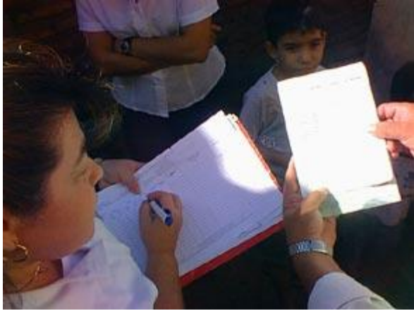
Health workers in Asunción, Paraguay , compare notes on neighborhoods with historically low vaccination coverage.