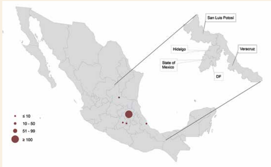
Figure 2 Cumulative cases of cholera in Mexico, by federal entity, 12 October 2013