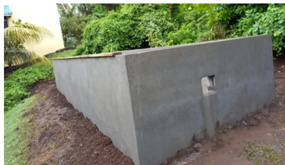
Figures 1 and 2: Concrete bases for water tanks at Biabou Clinic