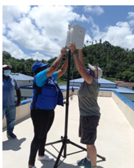
Georgetown SMART Hospital