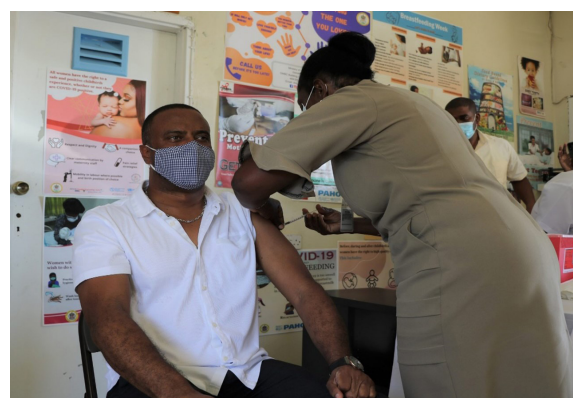
Hon. Premier Mark Brantley, Senior Minister of Health in the Nevis Island Administration.