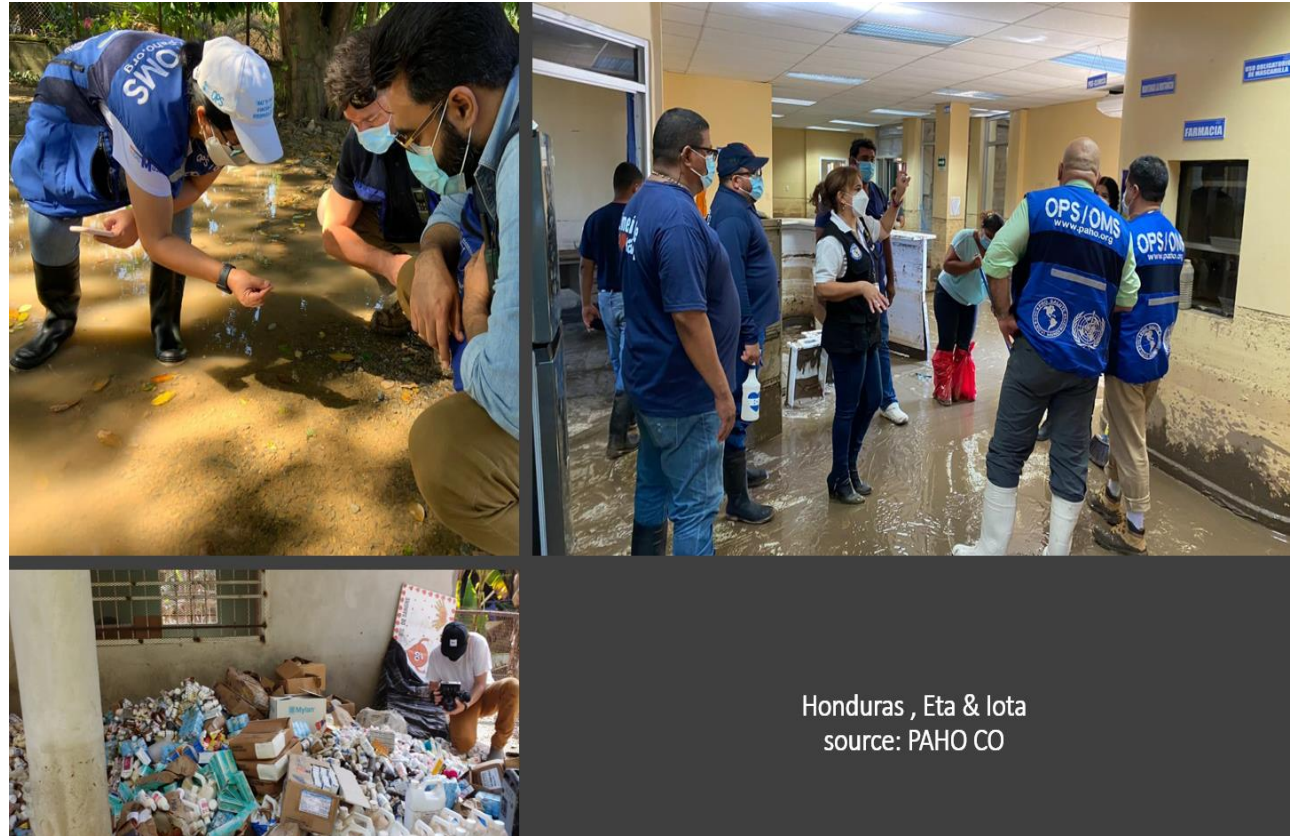
Honduras , Eta & Iota