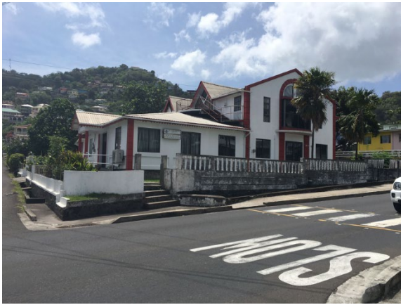
Annex to Health EOC to support health disaster coordination