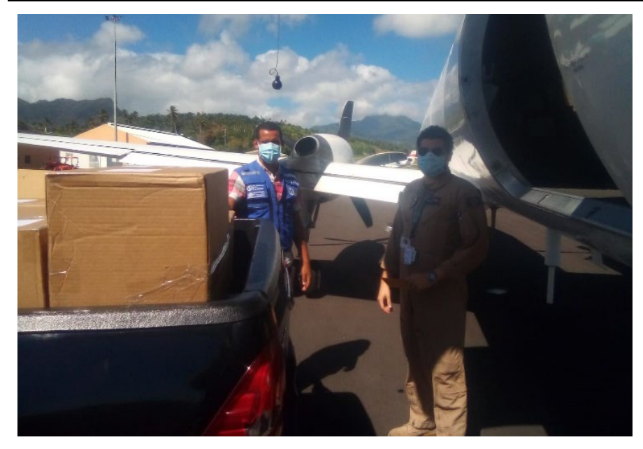
Shipment of COVID-19 supplies arrived in Dominica via the Regional Security System (RSS)