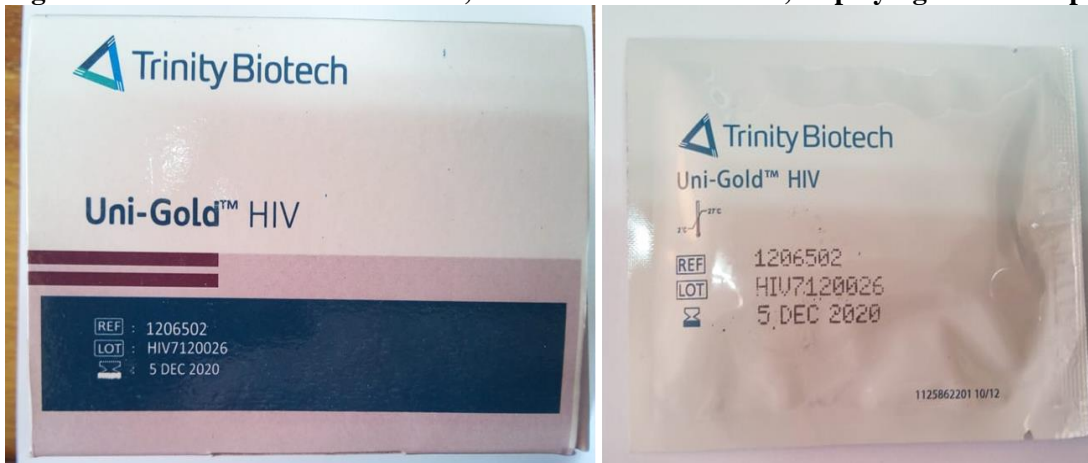
Figure 1 – Falsified Uni-Gold™ HIV, lot number HIV7120026, displaying falsified expiry date

Photographs and advice to the public are available below.