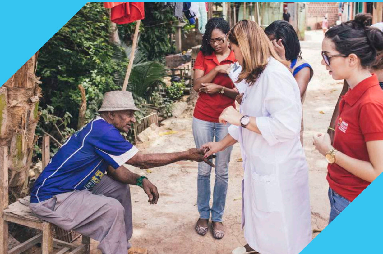
Health workers in the communities for early detection of leprosy.

students, and the Ministry of Health took advantage of the opportunity to conduct other interventions simultaneously, including administering antiparasitics to children and searching for and treating cases of other diseases that affect them, such as blinding trachoma and schistosomiasis. The program was conducted in more than 20,000 schools in Brazil.