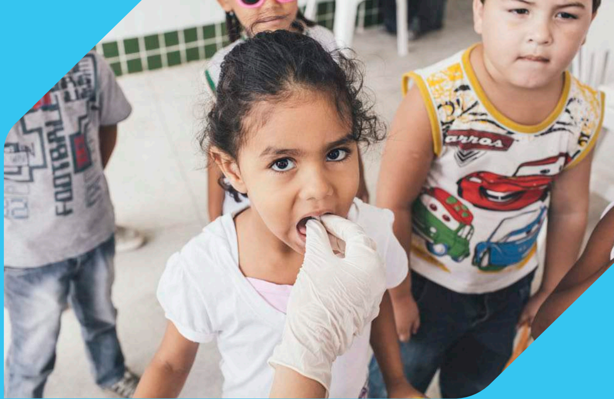
Children who are benefiting from coordinated campaigns against leprosy, trachoma, Soil Transmitted Helmenthiasis and schistosomiasis.

nature of the spot. The questions were designed to help the child and parents carry out self-examination of the skin to search for initial signs of leprosy. The sheet also provided basic information about the disease and its principal signs and symptoms, including images. The content focused on the fact that leprosy is curable, and that its treatment is free of charge and guaranteed by Brazil's Unified Health System ( Sistema Único de Saúde, SUS ).