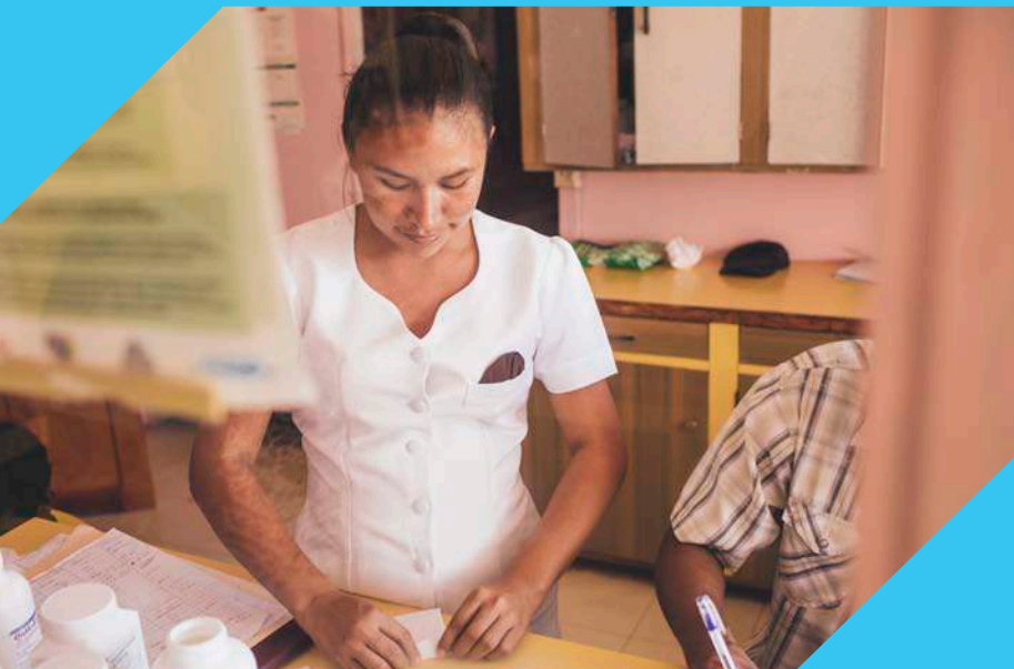
Health workers providing malaria medication.

The history of success in the Americas, as a model for other regions of the world, is completed with the example of Argentina, which in 2014 officially requested that WHO begin the process of certifying the elimination of malaria throughout its national territory.