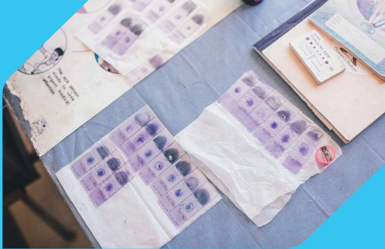
Diagnostic tests for malaria.

in preventing and controlling malaria and moving toward its elimination. These projects are examples of efforts that helped to drastically reduce the burden of malaria in the Americas in the last years. "We have taken an enormous step; we have seen a drastic reduction in the number of cases since last year," explained an official of the National Center for the Control of Tropical Diseases ( Centro Nacional de Control de Enfermedades Tropicales , CENCET), in the Dominican Republic. "I feel happy, because malaria workers always comes to visit us, and we are spraying and implementing control measures. One always lives with fear for one's children, because