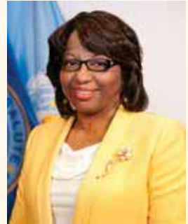
Dr. Carissa F. Etienne Director

This document is the first effort to support implementation of the sustainable development goals, especially SDG 3. It is intended to facilitate intersectoral dialogue and prepare the Region of the Americas for the launching of the SDG process, as well as during the implementation of activities that will be under way in January 2016. In the