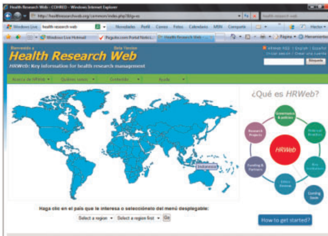
Figure 3: Health Research Website

This tool has the potential to become the most suitable and updated advisory instrument of the progress in the creation of NHRS in each country in the region by providing; a consultation center on governance and national policies on research; research priorities, networks and institutions dedicated to research support and management; and sources of funding for human and information resources for research. Its contents will be as rich as the amount of dedication each country devotes to it. The challenge lies on keeping it updated; national authorities will play a key role in disseminating the work done in this field.