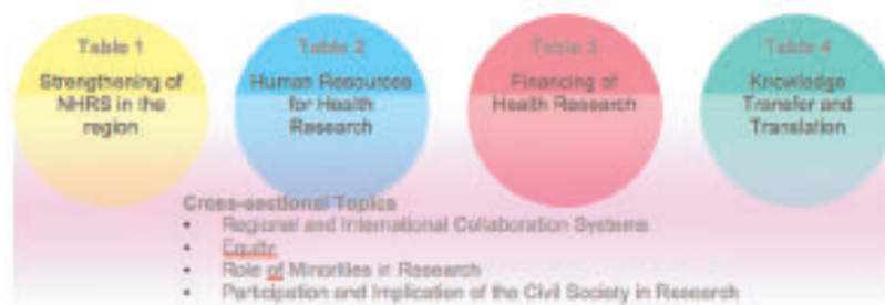
Figure 5: Topics for Debate at the World Café

Two moderators led the debate, assigned time to each specific topic to be discussed and integrated the opinions of each discussion group for the final presentation to the group as a whole. The meeting was enriched by the contribution of each of the participants coming from a variety of countries with different levels of development of NHRS; this favored a better interaction during the discussion period.