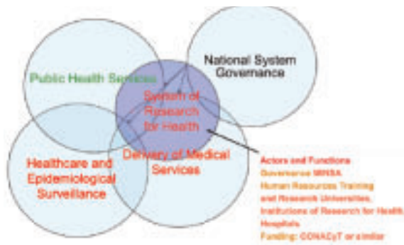
Figure 2: National Health Research System as a core element in the National Health System