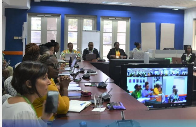
Representatives from across the Caribbean at the training on WHO QualityRights, held in Barbados in May 2024