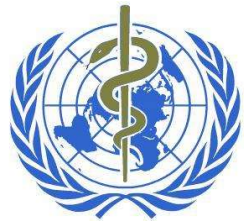
World Health Organization