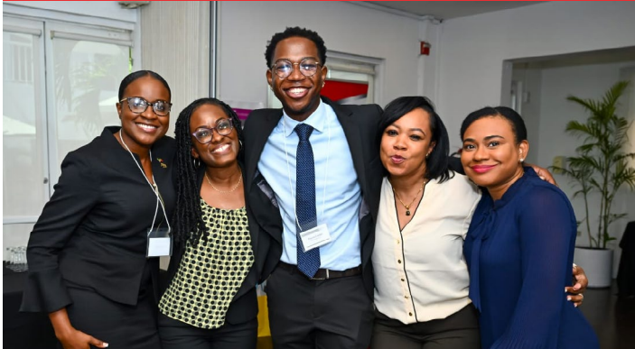
This seminar was organized by the Global Health Advocacy Incubator and the Global Centre for Legal Innovation in Food Environments, O’Neill Institute for National and Global Health Law (Kingston, Jamaica – 07-09 November 2023)