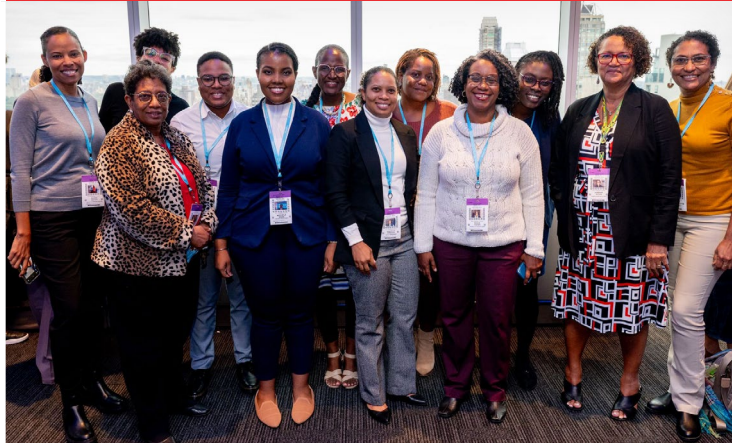
Bloomberg Global Partners Meeting on Food Policy (New York, USA – 30-31 October 2023)