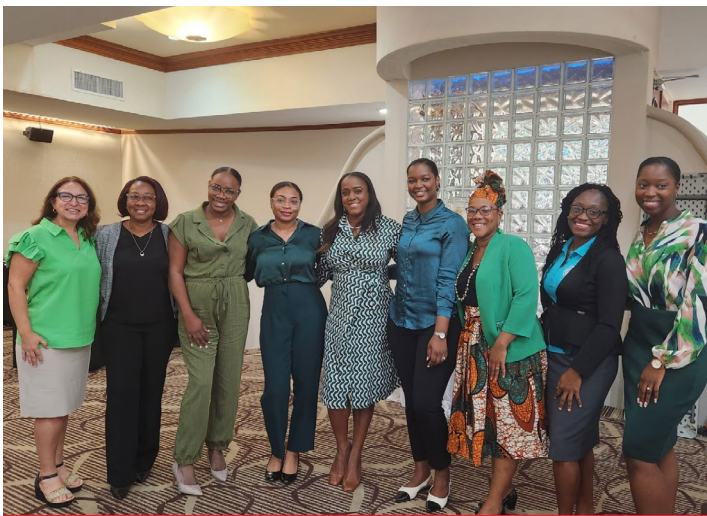
Celebrating meaningful collaboration: participants from diverse countries gather at the event's conclusion

It is hoped that this in person meeting is the first of many as the Forum continues to fulfil its mandate to promote and facilitate knowledge sharing, capacity building and cooperation across the Caribbean region in the area of public health law.