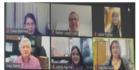
Snapshots of different virtual monthly sessions.