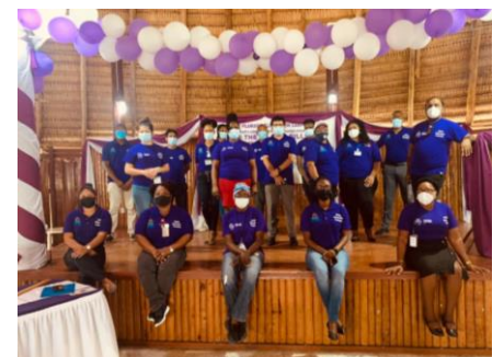
LF 2021 MDA: National Launch

Hon. Dr. Frank Anthony Minister of Health, Guyana