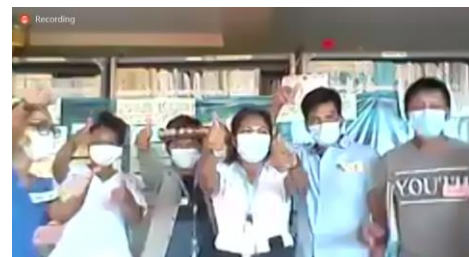
Stakeholders from the Health Services Network in Condorcanqui and DIRESA Amazonas identify policy options to address access barriers experienced by indigenous adolescents.

The analysis allowed the identification of the main access barriers experienced by indigenous adolescents and youth. Lack of integration of indigenous traditions in health service provision; stigma, fear, and shame; and geographical barriers were each recognized as playing an important role. Through policy dialogues, actors from the Condorcanqui Health Service Network, DIRESA Amazonas and indigenous community leaders identified community-based and health service provision interventions to be implemented in the short and medium term. Currently, DIRESA Amazonas continues to use these recommendations as the basis for advocacy efforts and adaptation of the Intercultural Health Sector Policy in Condorcanqui.