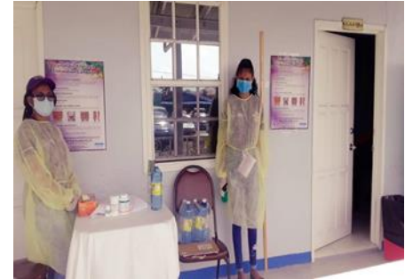
LF 2021 MDA Implementation Activity. Adoption of COVID 19 national guidelines

The success of the first round of IDA MDA proved Guyana's commitment to stopping the transmission of LF, while the success of the second round showed the country's relentless dedication to not only maintaining the gains of the first round but to also ensuring that this disease no longer burdens the health system and socioeconomic structure of the country and its citizens.