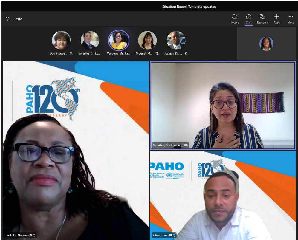
2 Nov. 2021: Meeting with Advisor, Health Emergencies (Caribbean) on recommended actions to support the country within the next 24 hours.