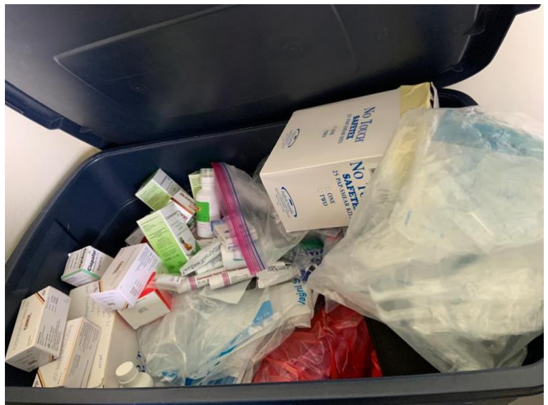
4 Nov. 2022: Review of Hurricane First Aid Kit at Hattieville Health Center, in Hattieville, Rural Belize District