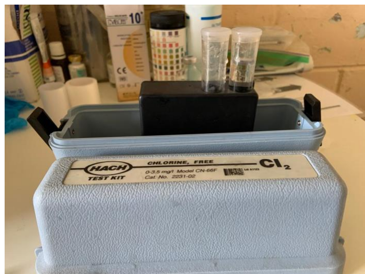
4 Nov. 2022: As part of WASH initiatives, Chlorine tests, reported levels of (0.2) concentration (Reference: (0.5-2.5)). Recommendations made to MoHW.