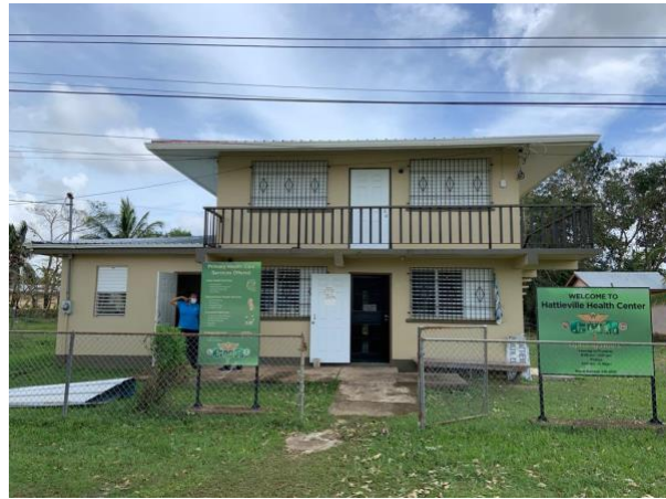
4 Nov. 2022: Assessment of the Hattieville Health Center in Hattieville, Rural Belize District