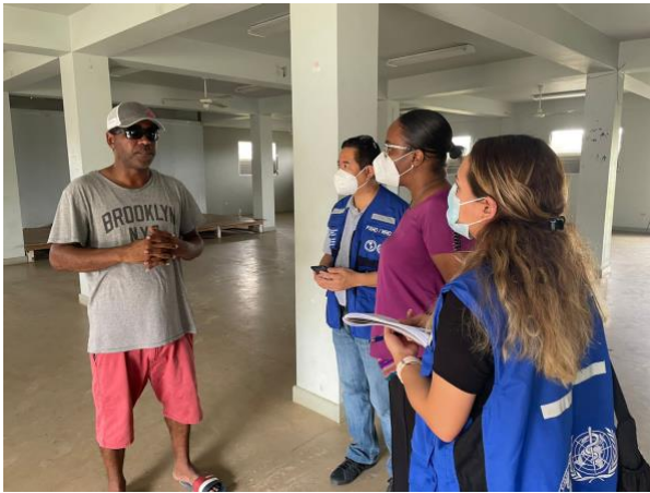
4 Nov. 2022: Meeting with Village Chairman and NEMO Staff at the Hattieville Community Center /hurricane shelter in Hattieville, Rural Belize District

4 Nov. 2022: Inspection of damaged homes in Hattieville, Rural Belize District