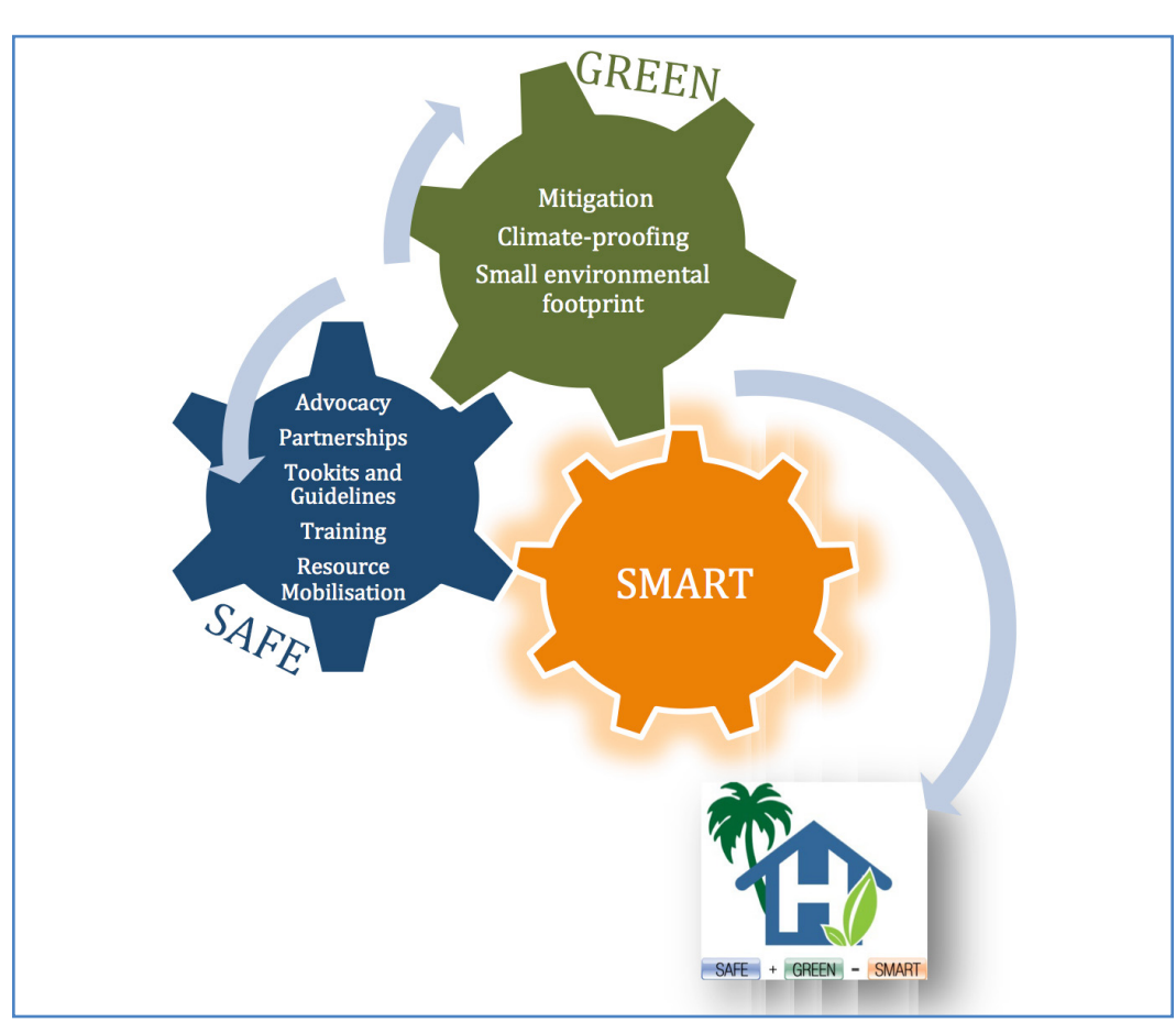
Figure 2 - Operationalising the Smart Health Facility Policy

The SMART Health Facilities Initiative represents a paradigm shift—away from the traditional disaster response model to one that proactively seeks to minimize the health impact of a disaster through climate adaptation, mitigation measures (including climate-proofing and reduction of the environmental footprint) and preparedness. Consequently, it is essential that this health policy is incorporated into the Member State's political agenda; that it is backed by earmarked resources in the national budget; and that it has the leadership and support of the highest levels of government.